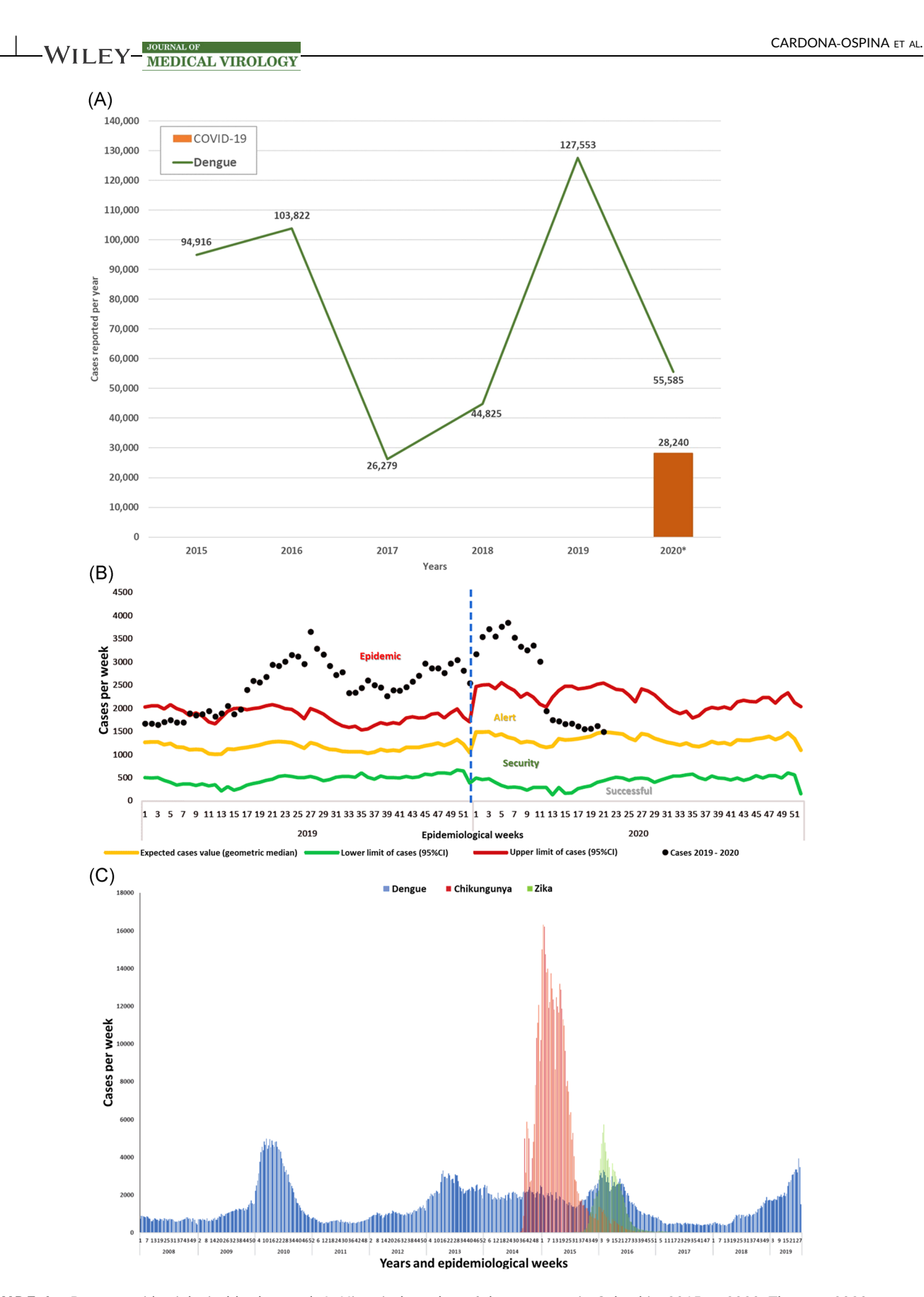
FIGURE 1 Dengue epidemiological background. A, Historical number of dengue cases in Colombia, 2015 to 2020. The year 2020 up to epidemiological week 22. B, Endemic corridors for dengue in Colombia, 2019 to 2020 (modified from www.ins.gov.co). C, Weekly number of cases of dengue, chikungunya and Zika in Colombia, 2008 to 2019